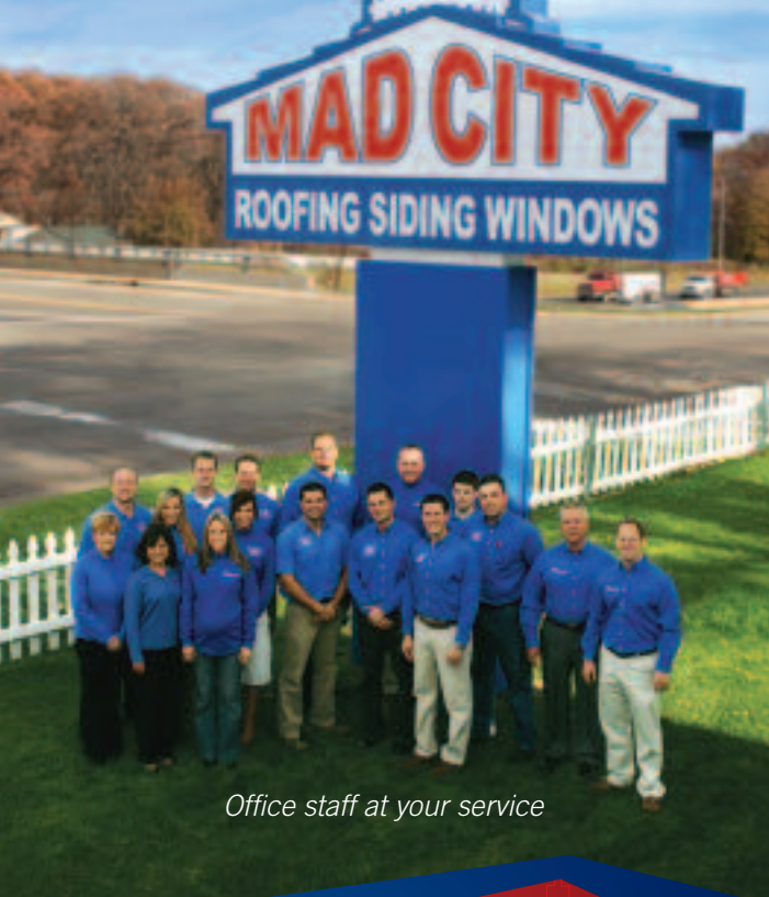
Office staff at your service

Locally owned and operated by “a couple of hard working Wisconsin boys” since 1998.